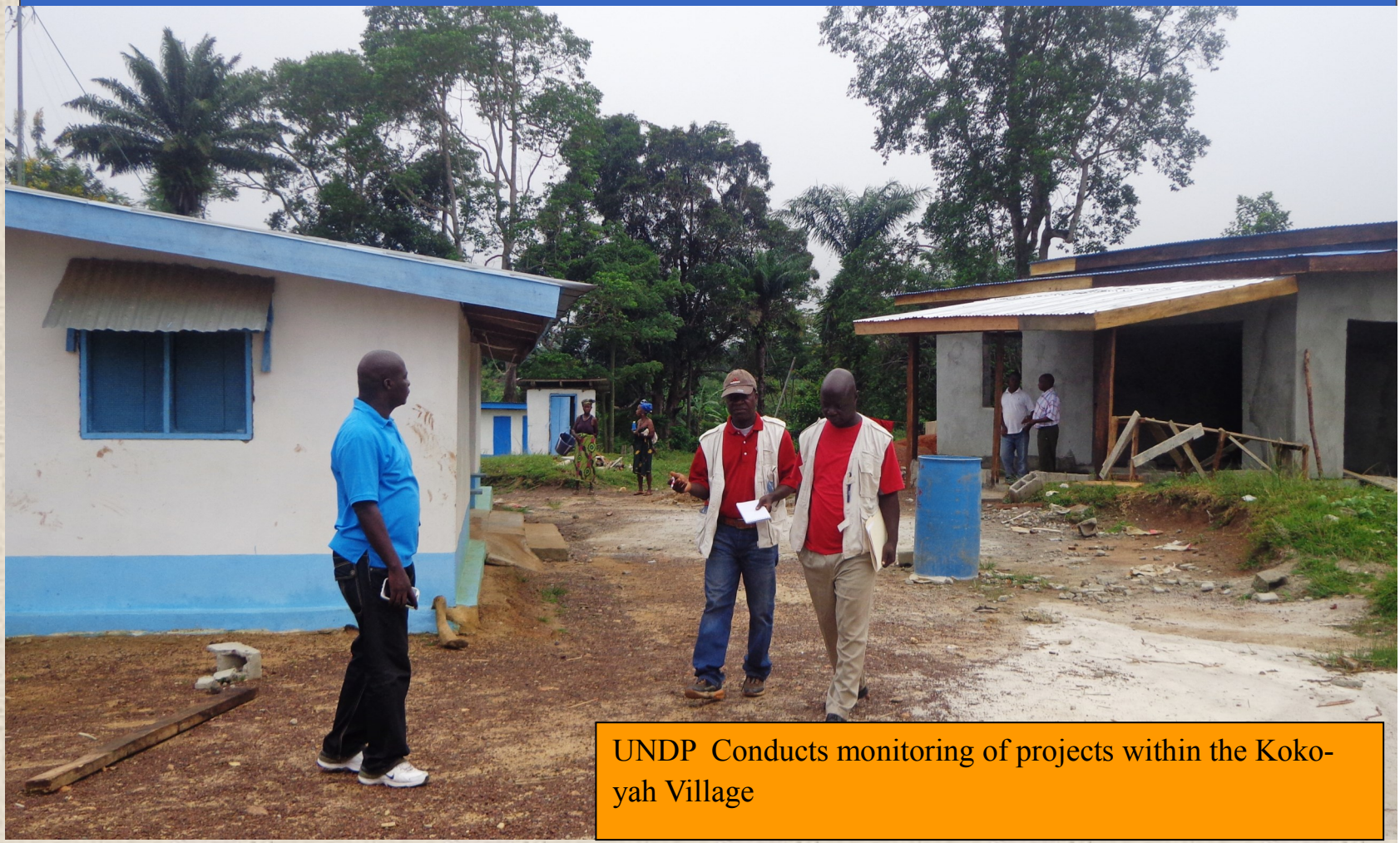
UNDP Conducts monitoring of projects within the Kokoyah Village

“The school is serving students from more than five towns and nearly ten villages around the area” Hanson said. The Kokoyah Public School was expanded to an eight classroom building with toilet facility.